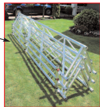
Showing how the unique trusses stack neatly for transport