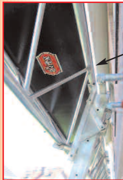
Showing how the unique trusses and the stabilisers fits against the wall