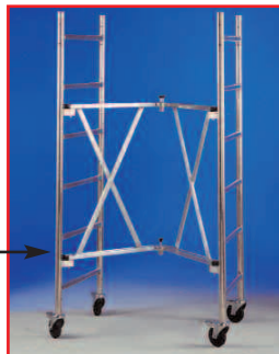
Roller S being Folded

TOEBOARDS AND 4 X STABILISERS SUPPLIED AS STANDARD WITH 3.95M PLATFORM HEIGHT AND ABOVE